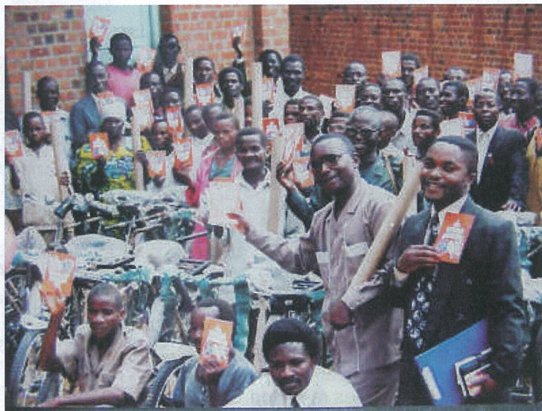
An archive photo from Wheels for God's Word's first outreach - Democratic Republic of the Congo, 1996